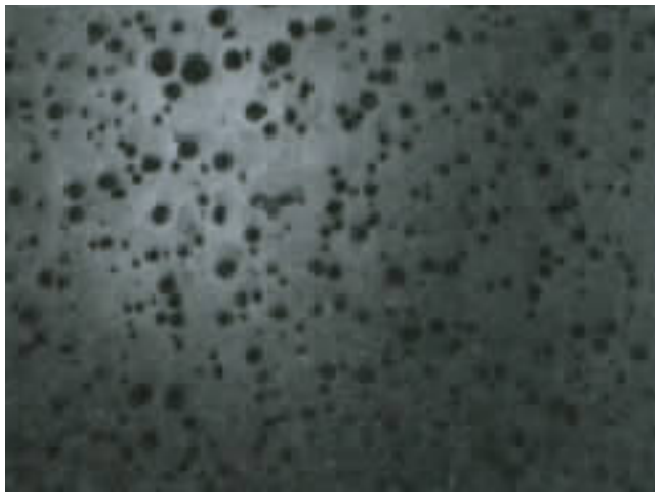
Fig. (2). Closed nodulizing treatment.

surface type of plane typing. It will result in terms of the six-cylinder crankshaft b, c, d, e link shaft at the parting line angle of 120 degrees, lower space, four connecting rod journal need sand to form the core. Core system requires specialized equipment and tooling, including with sand, plus resin, mixed system, inspection, radio batteries, paint brush and dry. Complicated process, high labor intensity, low productivity, high production costs, environmental pollution, and the sand core is easy to produce high temperature combustion such as porosity, improper under the core defect can cause the crankshaft RPM, crankshaft rejection rate.